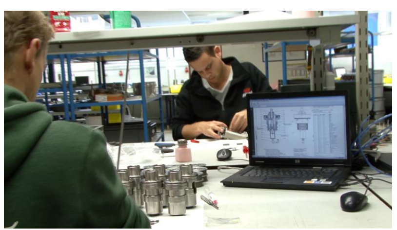
Figure 2 – EWI in Action

EWI's can also display and even edit supporting documents such as CAD files, Word or Excel documents and many more. Virtually any type of file that can be opened on a PC can be opened within an EWI. So, if an operator needs to view or modify a CAD file, this can be done in the EWI and they have all the capability that is available in the CAD viewer such as zooming in, rotating, exploding, etc. Try doing this with a paper work instruction!