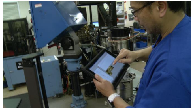
Figure 6 – EWI on a Tablet

EWI's are interactive and engaging. No more reading through paper documents which can lead to boredom and fatigue after many hours. With EWI's, operators are constantly engaged through an interactive and modern interface. Operators must pass steps confirming they have performed an operation, they must input measurements and scan components; they have constant positive feedback as they complete procedures and interactive support in the event of a failure. Images can be viewed and manipulated, and 3D CAD drawings can be navigated and exploded. Active, engaged, and interested operators are far more successful, than bored operators performing tasks from memory. Worse yet, boredom can lead to missed steps or even intentional short cuts. Regardless of the complexity of the task at hand, the operator becomes an integral component of a larger system and not just an automaton performing redundant tasks. The new paradigm engages operators as part of integrated, interactive environment.