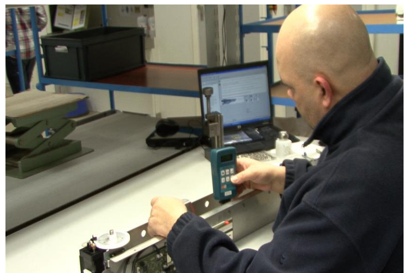
Figure 5 – Measurement Data Captured by EWI

An industrial air conditioner manufacturer implemented EWI's because of a specific yet persistent problem where operators were repeatedly installing the wrong motor. This mistake was typically not discovered until after the units were installed in their final location, typically on the roof of a building, ensuring that a simple oversight became a very expensive and visible blunder. With the full implementation of EWI's, the manufacturer was able to simultaneously simplify the procedure and validate each installed component in real time using a barcode scanner. This serious problem was never experienced again.