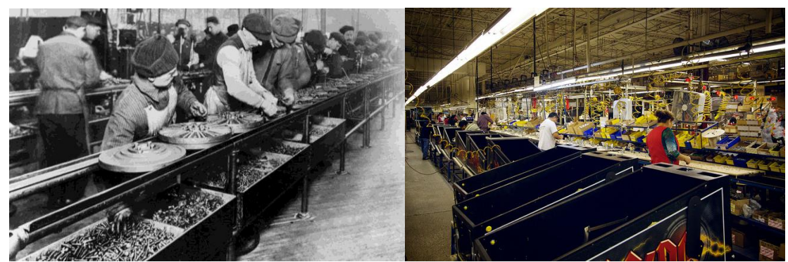
Figure 1 – Manufacturing 100 Years Ago vs. Now

While there are quite dramatic and evident improvements in almost every facet of manufacturing over the last several decades owing to the advent and mass adoption of computer automation and networking, there is one facet of production that remains stubbornly unaffected. Massive databases track everything from orders, to inventory, to personnel. CAD systems allow for interactive and dynamic 3D rendering and testing, digital troubleshooting, and simulation and analysis prior to mass production. Yet, with all of this computational power and all of this networking capability, one element of production has remained thoroughly and firmly planted in the past. Nearly all manufacturing or assembly procedures are created, deployed, and stored using methodologies derived from a set of assumptions that ceased to be relevant fifty years ago. This set of assumptions, referred to below as the "Paper Paradigm" has been, and continues as the dominant paradigm for manufacturing procedures to this day. It is time for a new paradigm, one that accounts for the vastly different technological landscape of this era, one that provides for a simple, efficient interface, deep traceability, and dynamic response to rapidly changing economic forces.